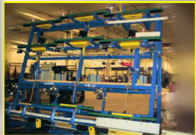
Belt conveyor that handles a 500 lb component

Loads to 1,000 lbs Integrated controls Air and electric driven Coordinated with automation Robot loading & unloading