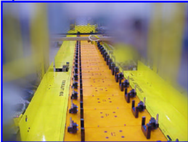
Accumulation Conveyor with 15 sec. Index time