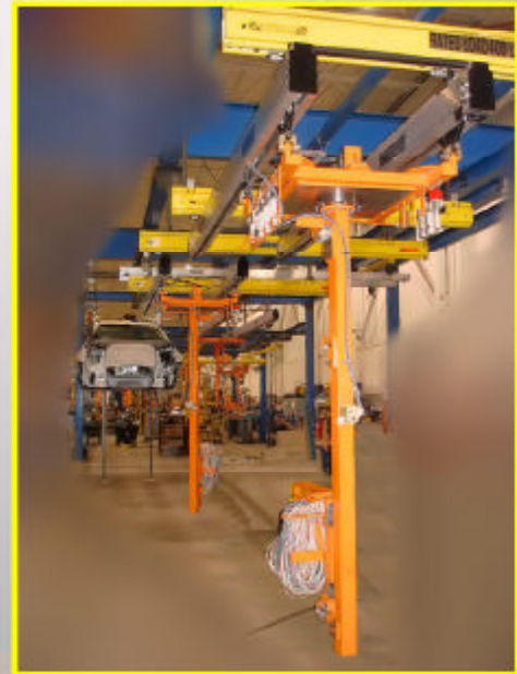
Lift assists for moving parts out of racks and into the assembly line