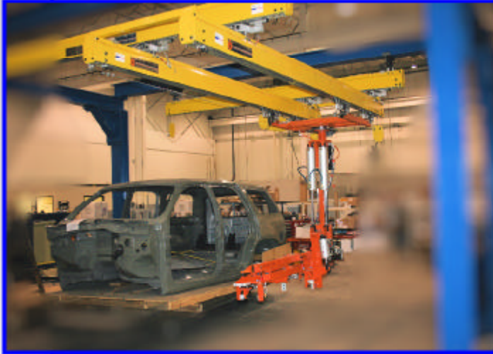
Hybrid Battery load tool with articulating arm