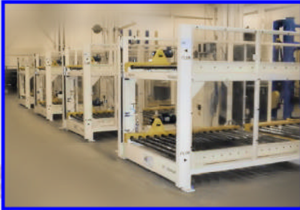
Designed for a variety of dunnage sizes