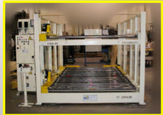
Gravity feed and power lift